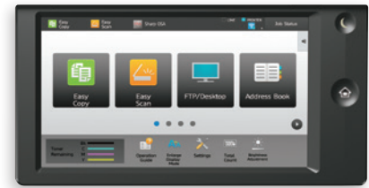
Sharp's customizable touchscreen display offers a user-friendly graphical interface, and is common across 30+ models.