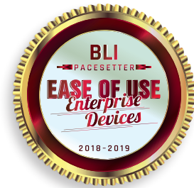
"Pacesetter Award in Ease of Use 2018-2019"